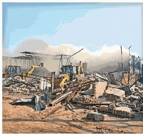
अनेक फैक्ट्रियों को ध्वस्त करता बुलडोजर। कार्रवाई के दौरान कई रिपिट अधिकारी मौजूद रहे • गाजियाबाद