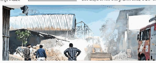
जमींदारों की गा रहे अविश्वसनीय इकाइयों के चलते उठती धूल • गाजियाबाद