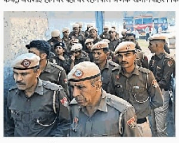
मीके पर तैनात भारी पुलिसबल • गाजियाबाद