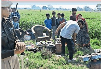
फैक्ट्री बरखाई होने पर बंद पर रहने वाले श्रमिक समान बाहर निकालने हुए • गाजियाबाद